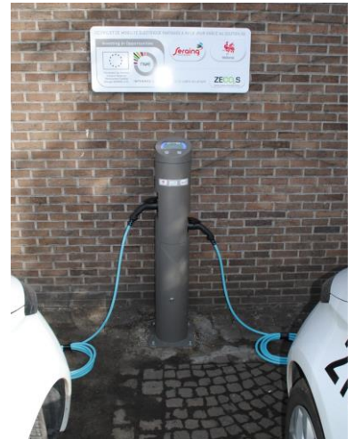
Charging station at facility building with billboard