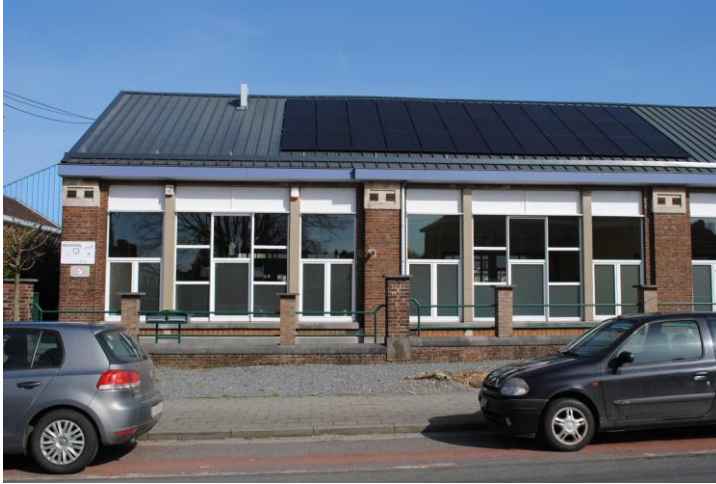
Photovoltaic installation 1 at Distexhe school