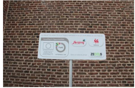
Billboard of charging stations