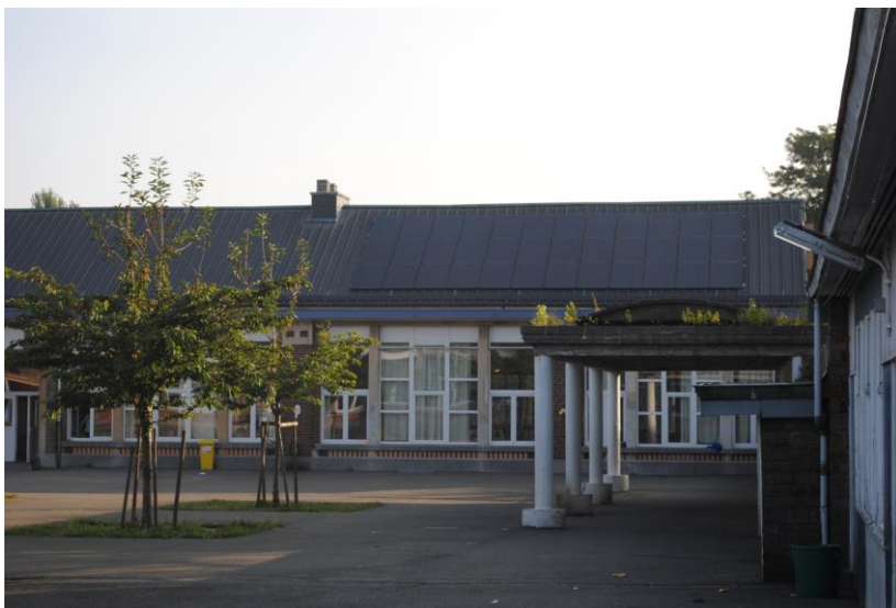
Photovoltaic installation 2 at Distexhe school