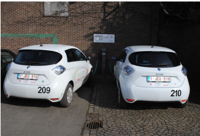
2 of the 3 e-cars during charging phase