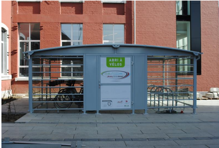
Bicycle shelter at Kuborn square with Billboard

with the partners who helped us to consider a CO 2 neutral project by adding a PV installation to our investment, which was not planned from the beginning!