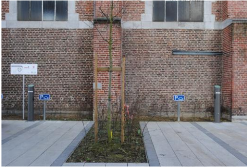
Picture of 2 charging stations at Kuborn square