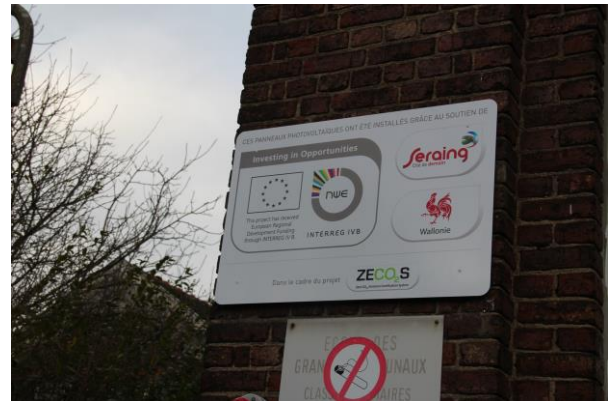
Billboard of PV installation